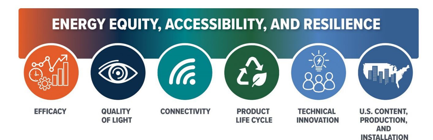
Figure 1: The L-Prize aims to drive creation of interoperable lighting systems that demonstrate exceptional achievement across six distinct categories. Through the challenging criteria within these categories, the competition can directly influence the equity, accessibility, and resilience benefits of advanced lighting systems.

The goal of this L-Prize is to advance the U.S. clean energy economy for next-generation LED lighting, encouraging technology developers and researchers to engage in advanced lighting system development, which in turn will lead to transformative designs, products, and impact. The challenging technical requirements are intended to stimulate creative approaches that raise the bar for efficacy, quality of light, connectivity, resilience, and life cycle environmental impact (see FIGURE 1). Currently available technologies and systems may excel in one performance area, but often at the expense of others (e.g., some excel at efficacy but at the expense of color rendition, flicker, or glare. This can have negative impacts on worker safety, productivity, or well-being). This L-Prize aims to drive creation of accessible and interoperable lighting systems that demonstrate exceptional achievement in all areas and for all American businesses and consumers.